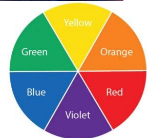
Primary and Secondary Colours