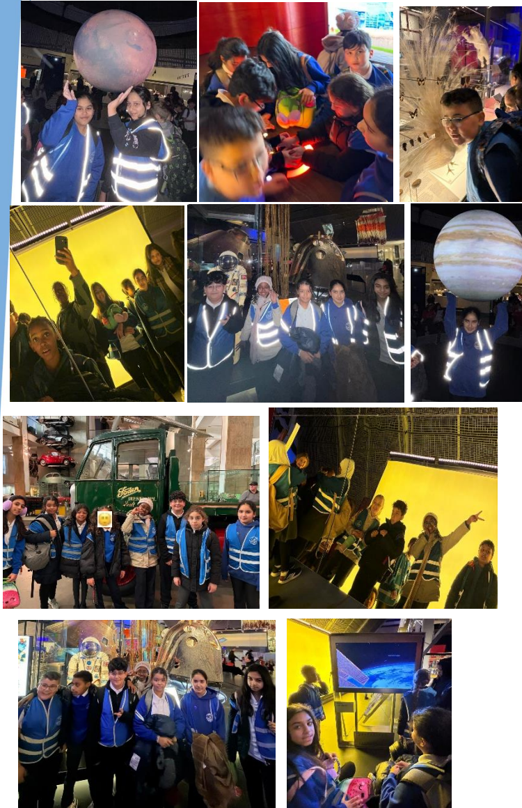
Skills Builder: International Volunteers Day Challenge: Pass it on!

It was 5 Red's turn to visit the Science Museum last week. They had an amazing day exploring the space section- their Science topic this term.